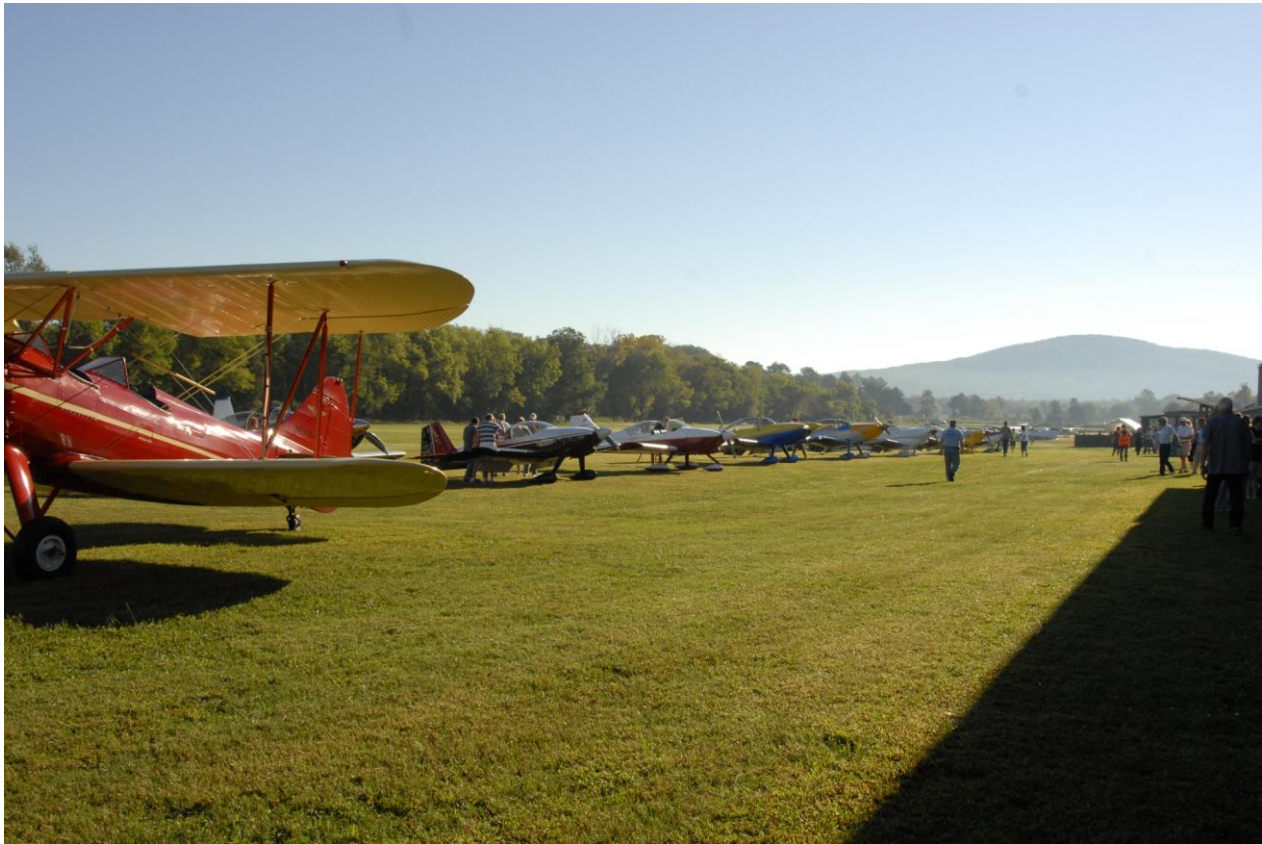
OK, here we go again – Moontown’s Annual Grass Field Fly-In