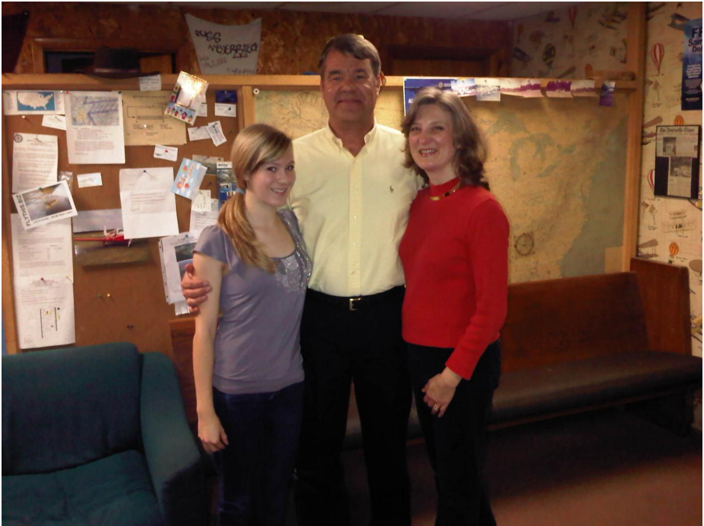
Merry Christmas from Moontown Airport