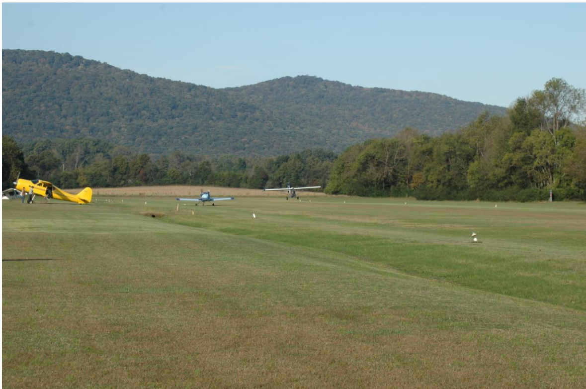
Moontown Airport – 3M5 - Home