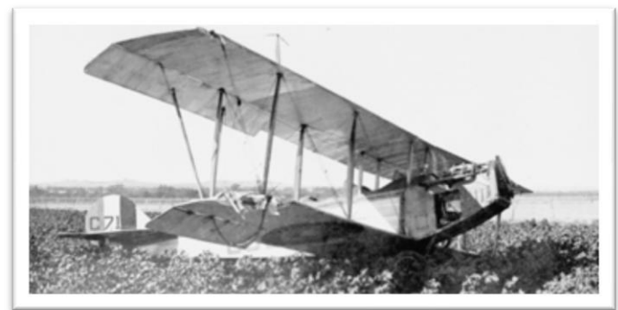
Figure 2: Curtiss JN-4, following an off-field training accident.

3. The simplest, safest way to get a Jenny out of a small field is with a good dray and a team of mules.