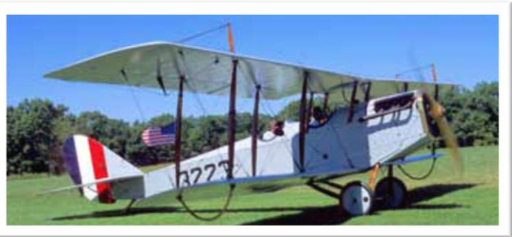
Figure 3: One of only a handful of airworthy Curtiss Jennys seen here at the Antique Airplane Association flyin in Blakesburg, Iowa, in 2009.

9. A good, reliable compass should be in every ship, for in any cross-country flying, especially passing through clouds or fog, it is very easy to lose one’s bearings. This was forcibly brought to my notice during my recent flight to China, which I foolishly attempted without a compass. When well out over the Pacific, I encountered fog and, within the space of a few minutes, had completely lost my bearings. Not only my main bearings, but my crankshaft, as well. I did not notice this at the time and kept going until I arrived in China a few days later. You can imagine, after I stopped to take on gas, my dismay when I tried cranking the motor and found the crankshaft was missing. Well, an engine is no good without a crankshaft, so, in order to get on with my trip, I had to have the ship towed by some local oxen to the top of a hill. As I gained speed in the descent, I engaged the landing gear with the timing gear, and the ship took off in a spectacular manner. In fact, it took off two chimneys, plus a Chinaman’s queue, which I could not dodge as it was standing straight up, no doubt from fright. Ever since I have made a point of using a compass.