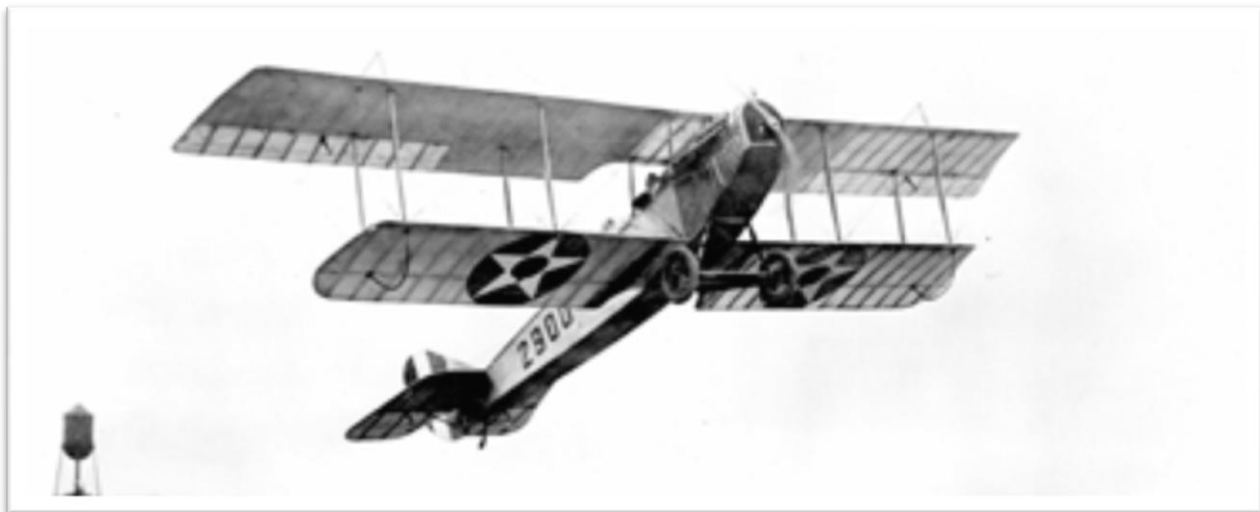
Figure 1: Curtiss JN-4D, 2900, executes a steep take-off climb.

(excerpted from a 1921 aviation magazine)