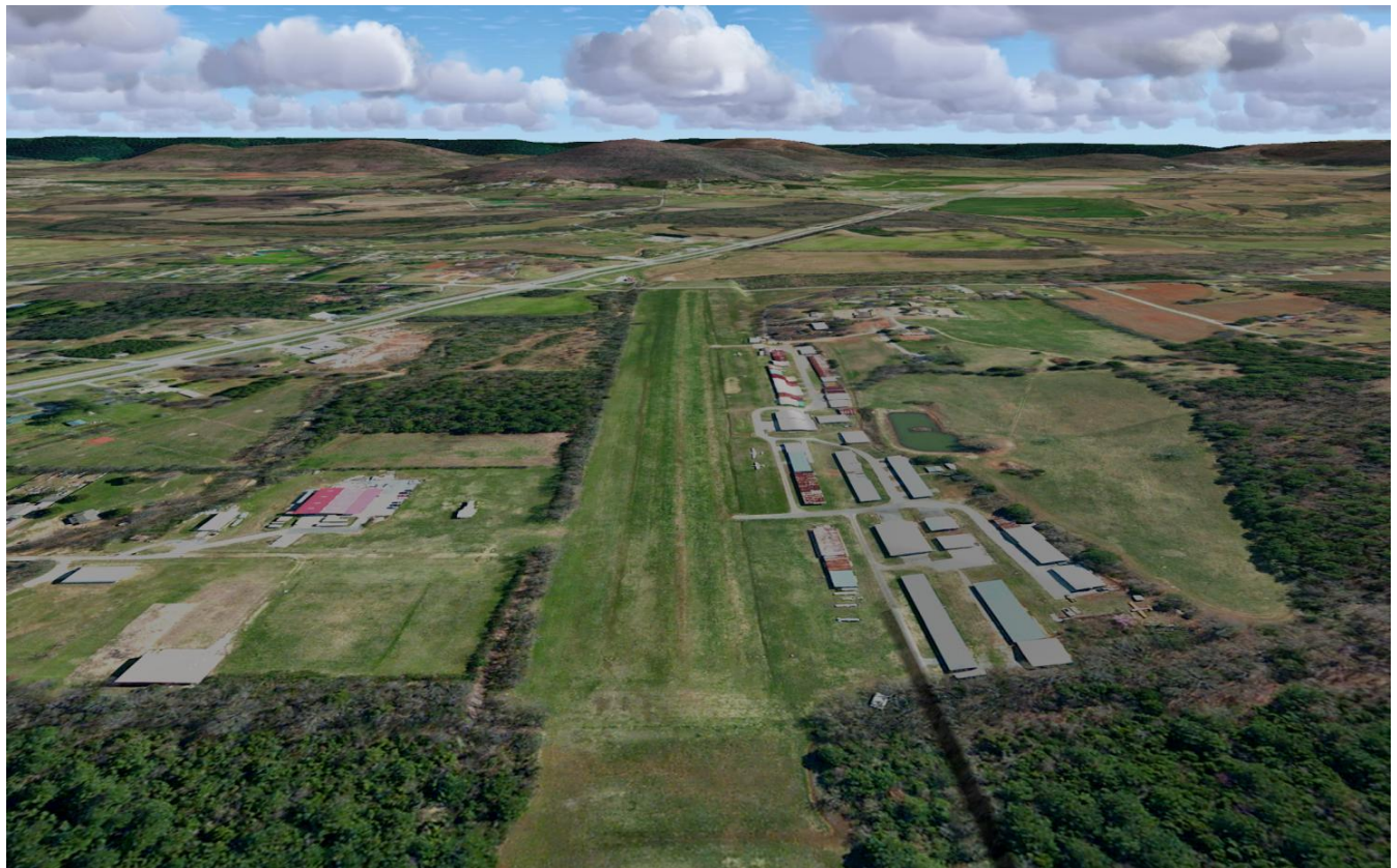
9 - 3M5