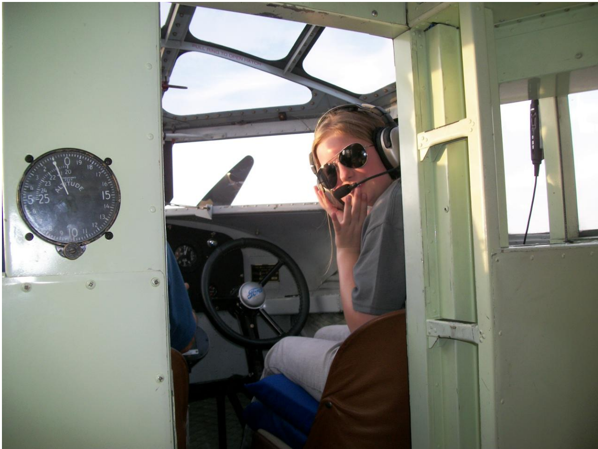
C'mon-on girls, let's show them how it's done!