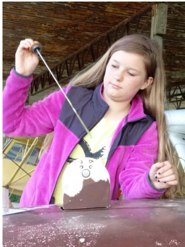
Pilots, young and old, - A thorough pre-flight is essential!

NOTE: All who attend Oshkosh: If you get any good photos, please submit them for photo of the Month. Thanks