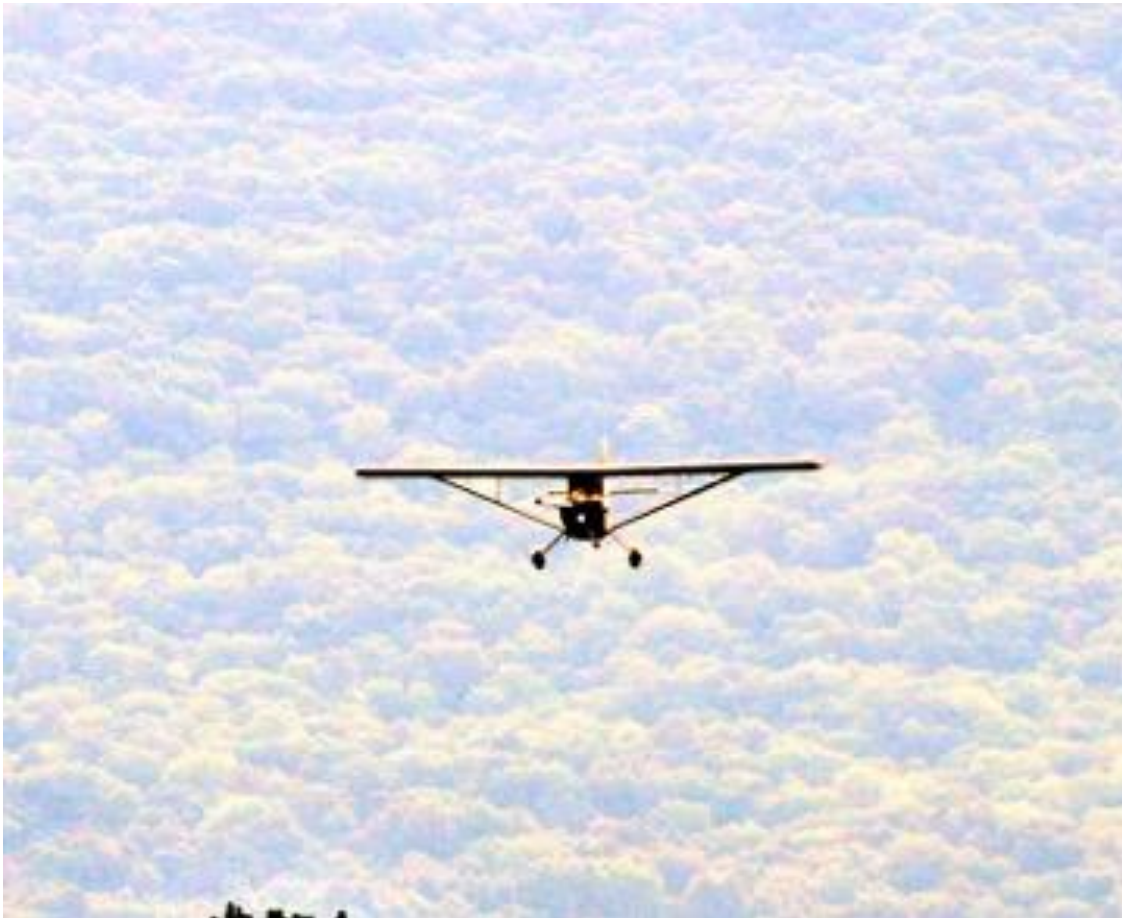
Only at 3M5 do we have so many trees behind us on final