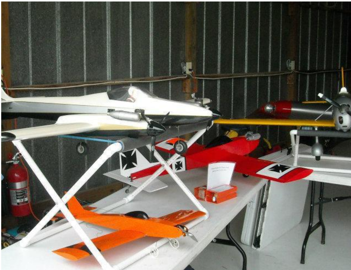
Planes for anybody