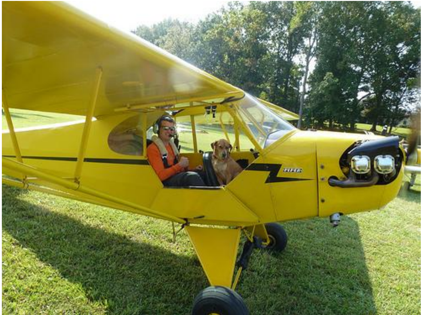
Someone Said Breakfast