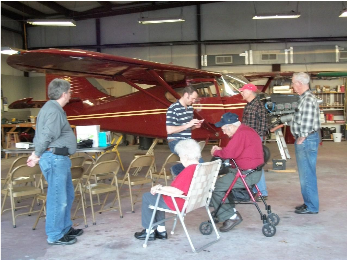
Last Month's Chapter Meeting