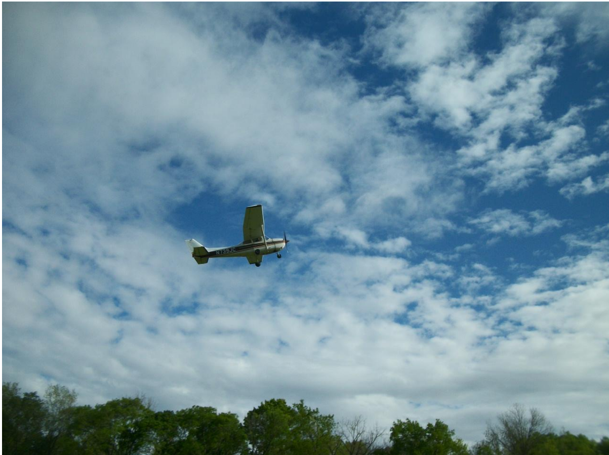
Spring is Here - Time to Fly