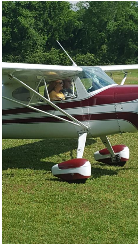
Another arrival of our flying family