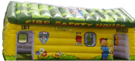
Guntersville Fire Department "Fire Safety House" will be onsite for everyone to enjoy!

Guntersville Police Department will be offering Finger Printing Services