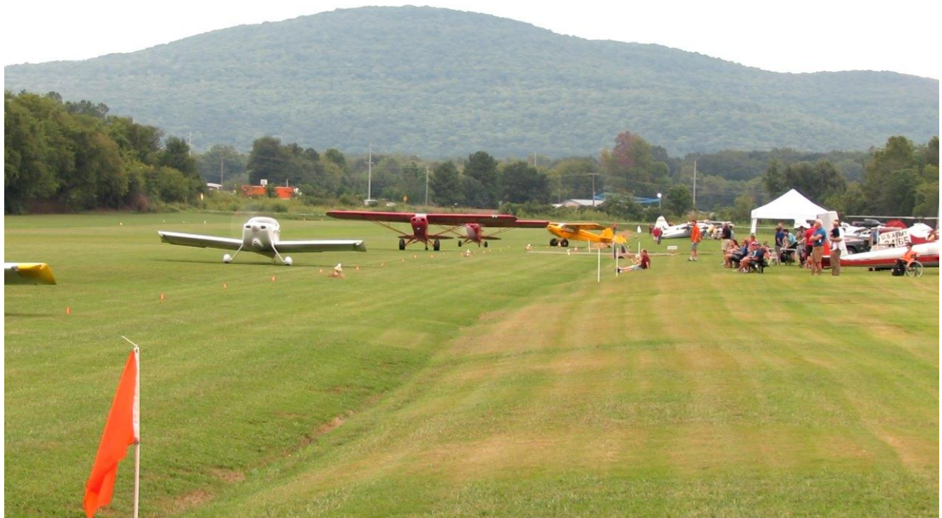
Moontown International!