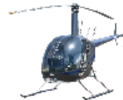
Marshall County Sheriff's Helicopter scheduled to be onsite