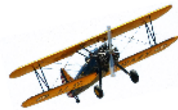
Homer Wilson Vintage Aircraft Museum will be OPEN

SATURDAY NOVEMBER 12th BREAKFAST @ 08:00 AM