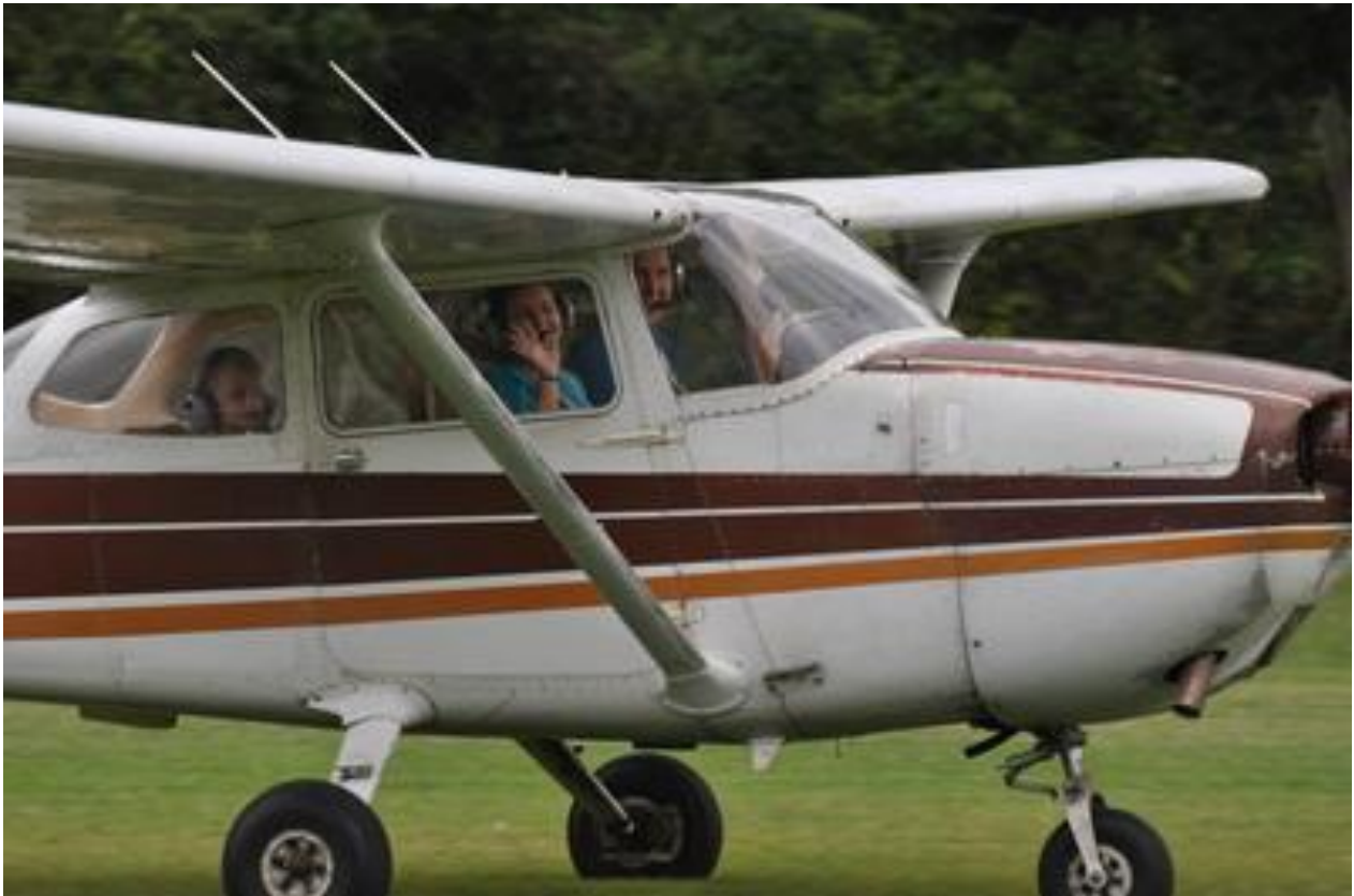
I'm Here; Is breakfast Ready?!